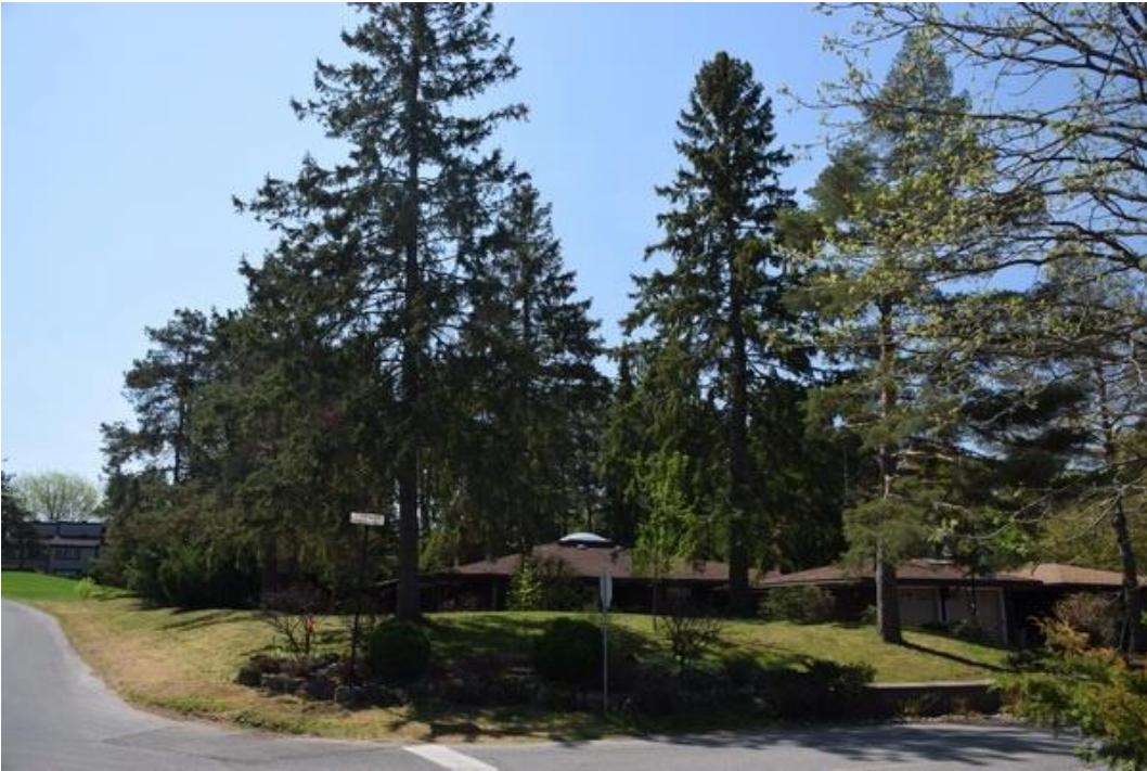
Tiffany – example of home nestled in the landscape