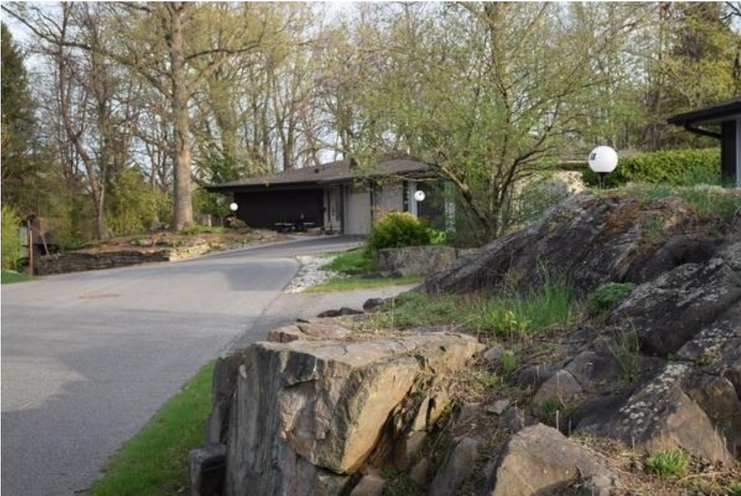
Tiffany – use of hill and rock outcropping