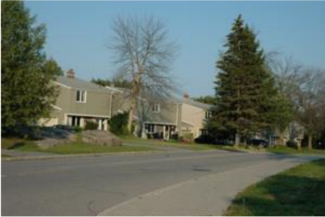
Varley Drive: Jackson Ct Condominiums