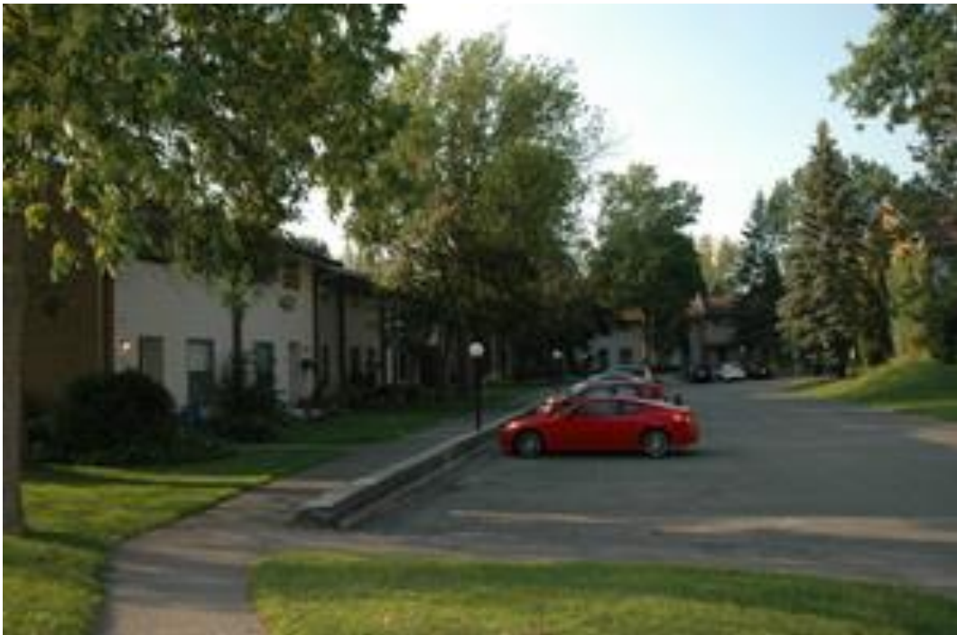
Carr Crescent: Carmichael Court Condos