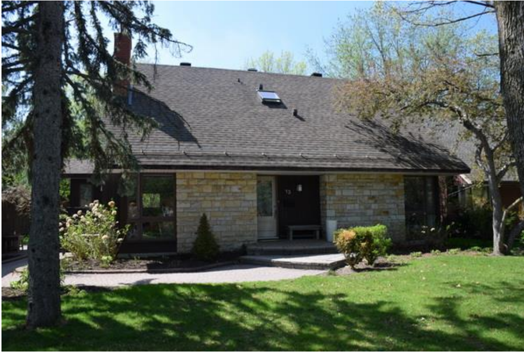
Pentland Home – example of use of stone vs. brick