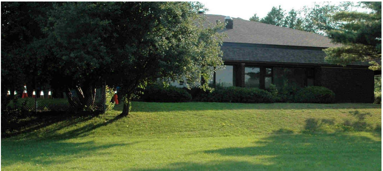
Elsie Stapleford Child Care Centre (Teron Rd.)