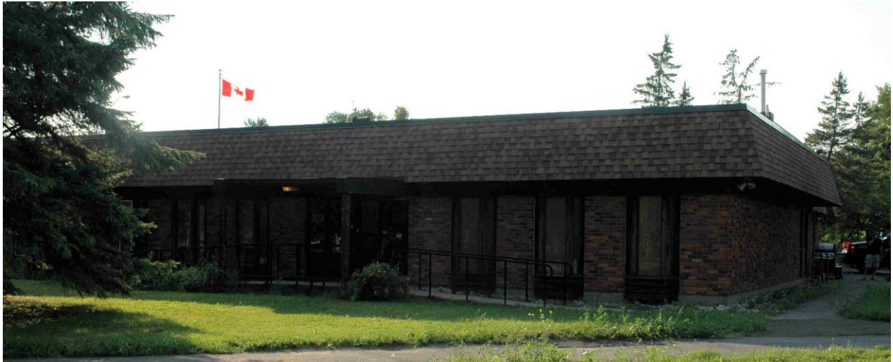
Fire Station – was also first public library (corner of Teron/Beaverbrook)