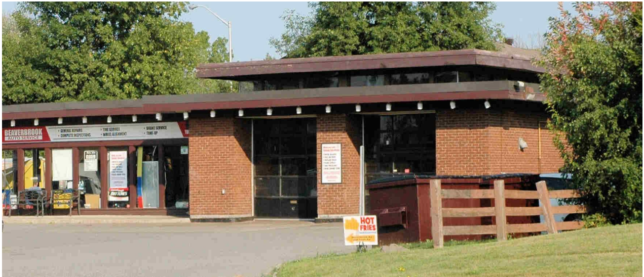
Service Station (corner of Teron/Beaverbrook)