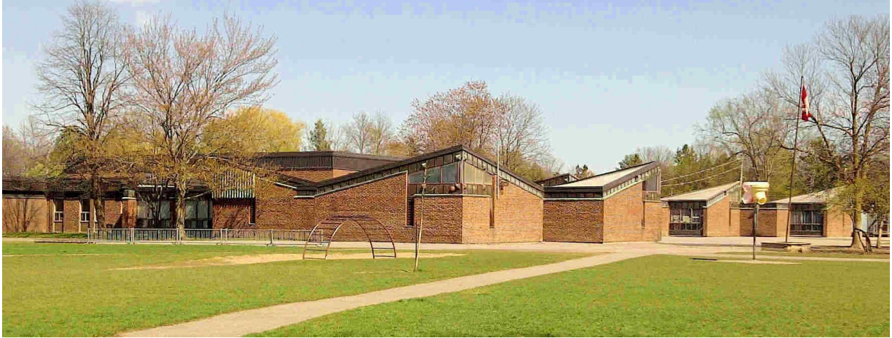
Stephen Leacock Elementary