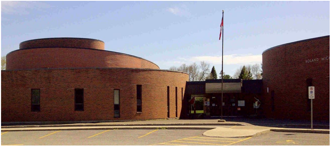
Roland Michener Elementary