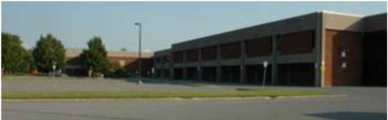
Earl of March Secondary School