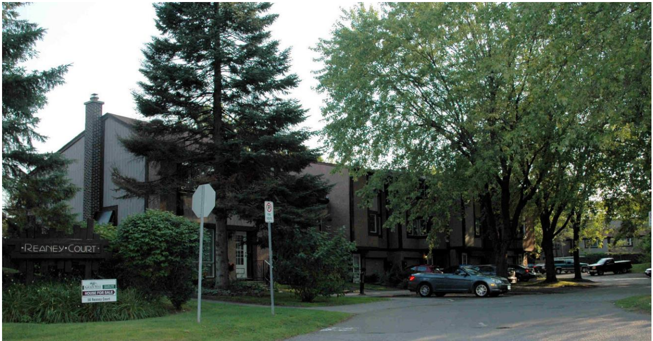
Reaney Court - condos