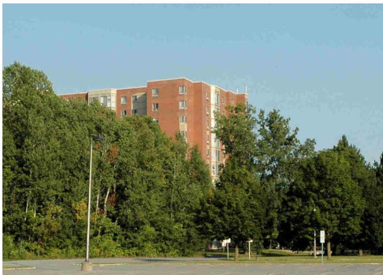
The Atriums as seen from The Parkway (extensive screening via trees, etc.)