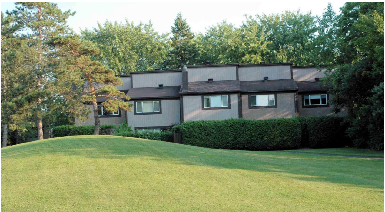
Reaney Court – Condos (backing on to greenspace)