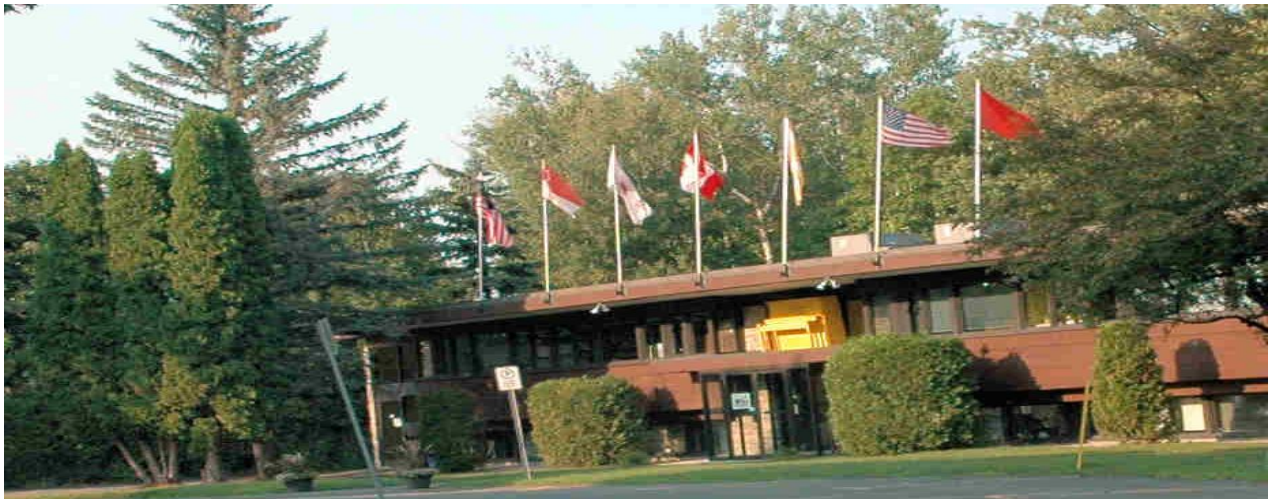
Originally National Headquarters of Junior Chamber of Commerce, now Music for Young Children