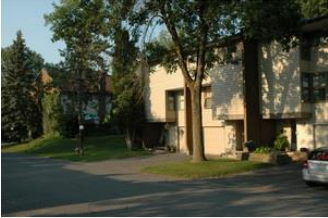
Carr Crescent: Carmichael Court Condos