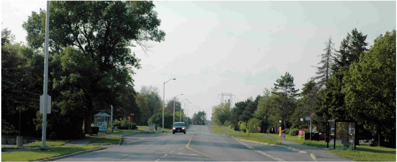
Teron Rd Facing North