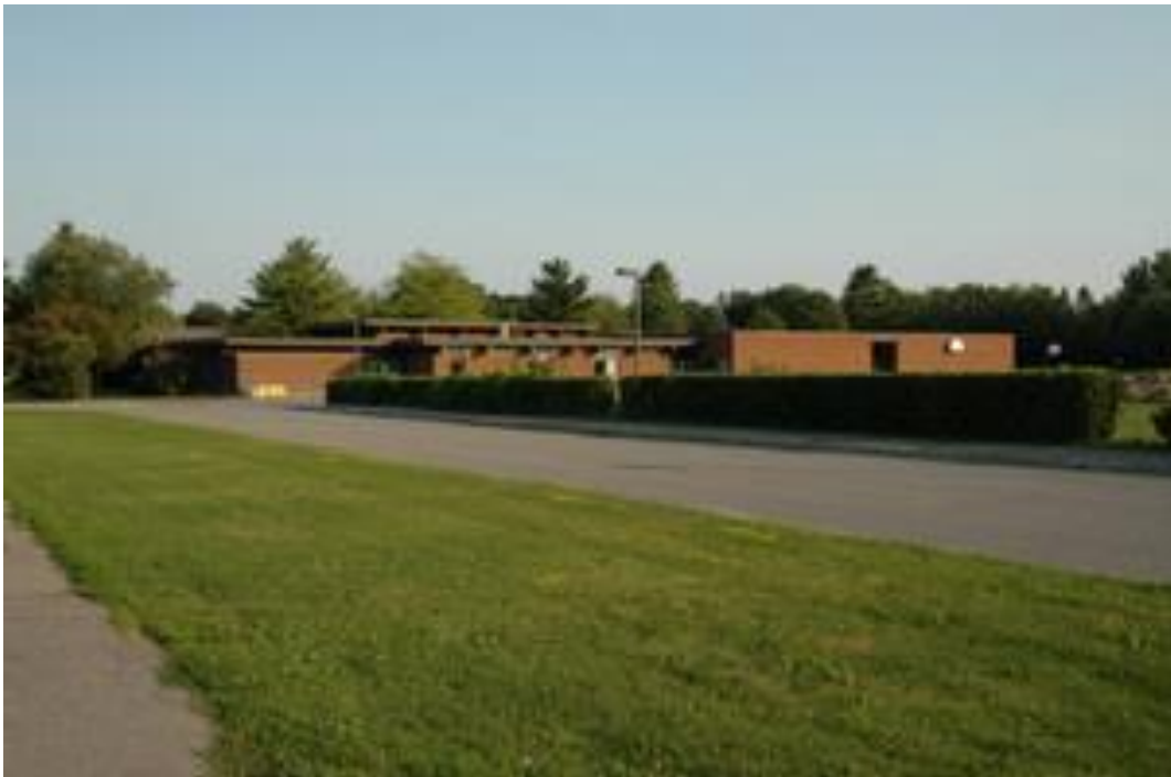
Georges Vanier Separate School