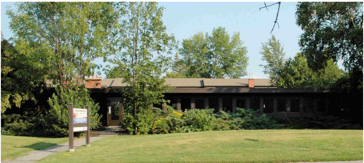
Professional Offices (across from Beaverbrook Mall)