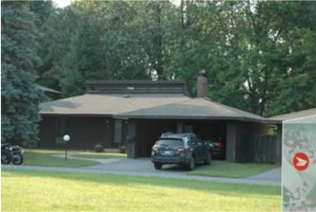
Out of character Post Boxes