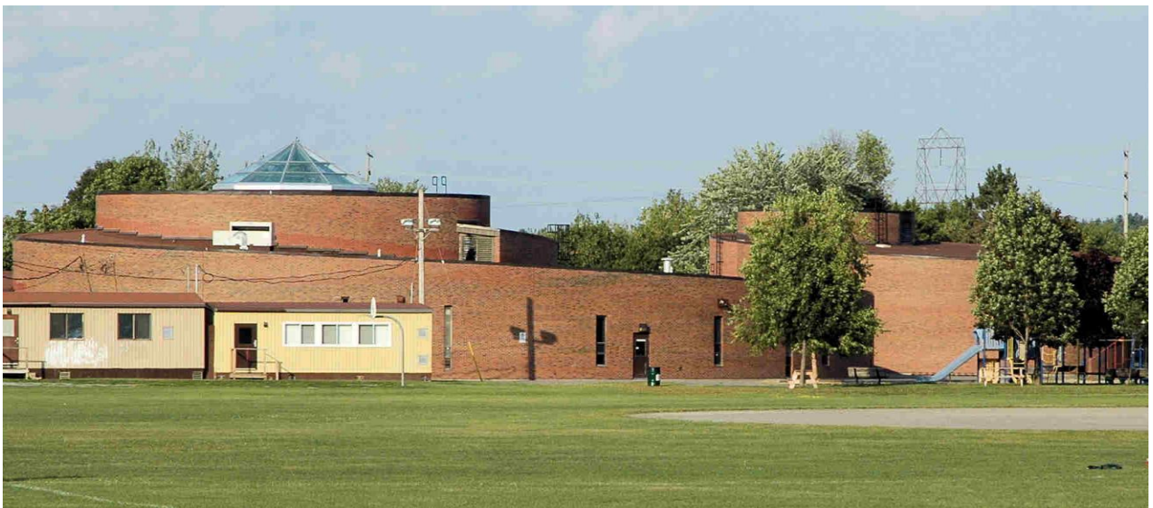
Roland Michener Elementary