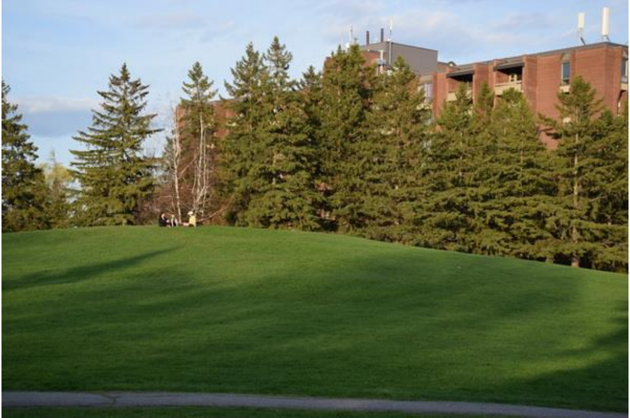
Varley Apts as seen from road (extensive screening, greenspace) Toboggan hill in foreground