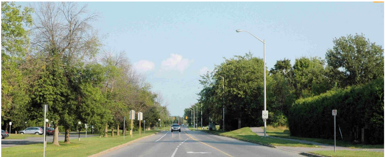
Teron Rd Facing South