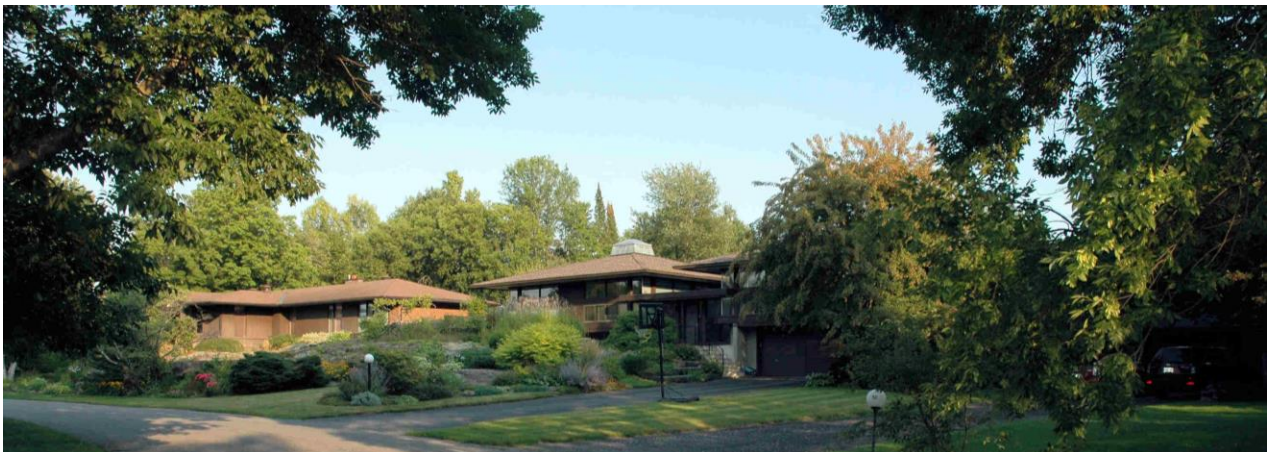
California and adjacent properties