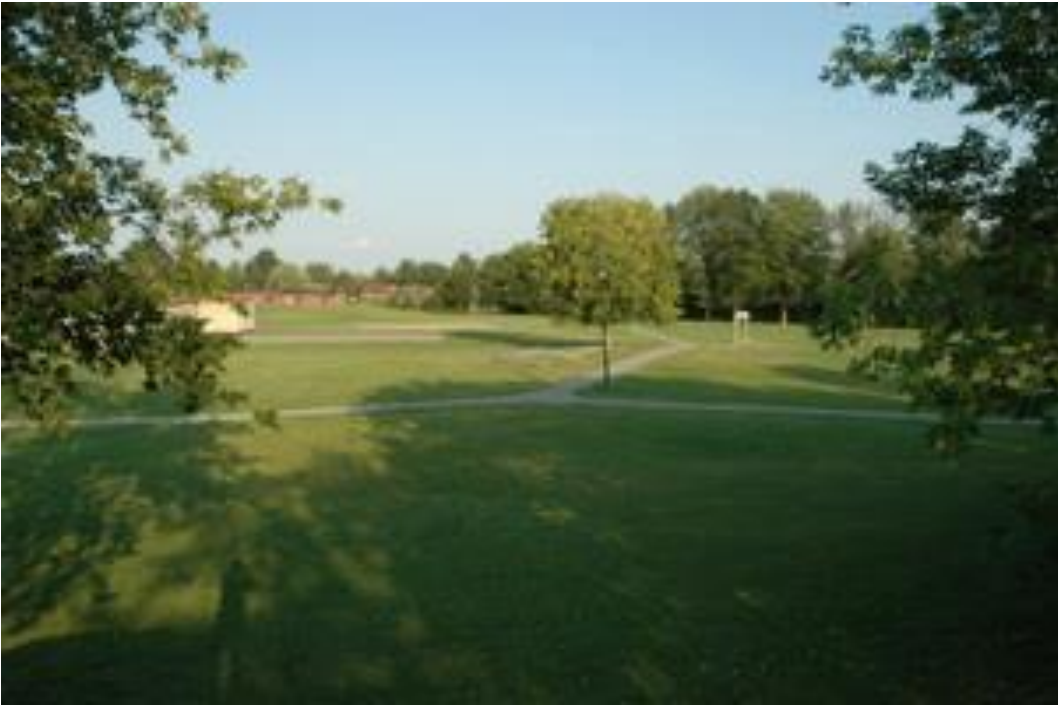
Park behind Elementary Schools/homes on Varley