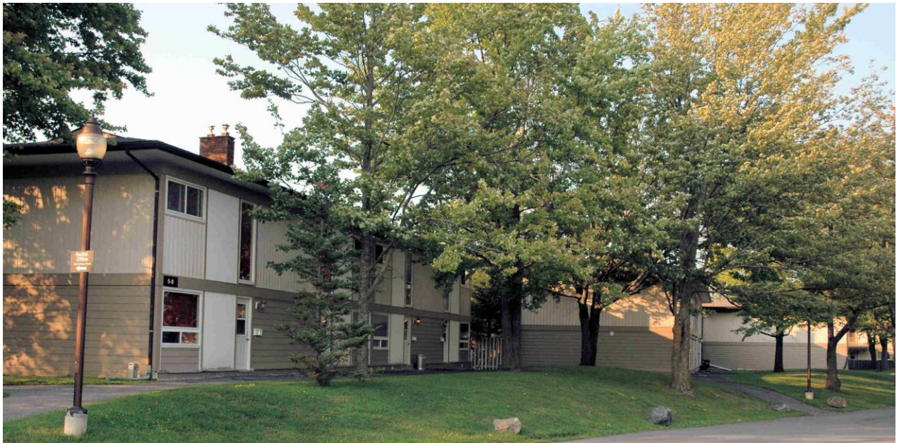
Varley Drive Rental Townhouses