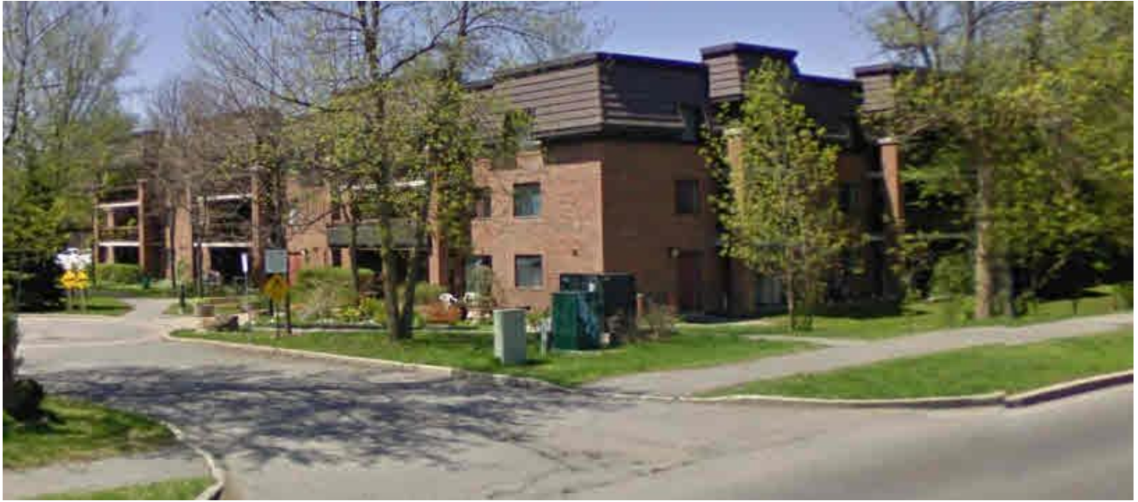
Co-op Housing (Teron Rd.)