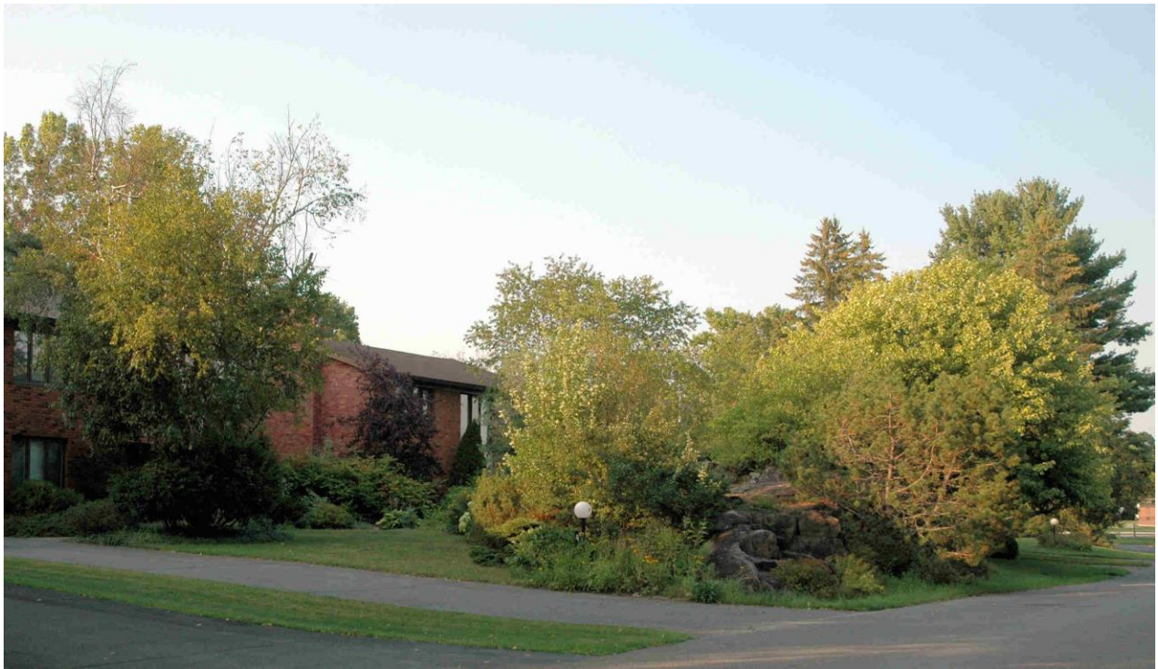
Tiffany – one of many examples of rock outcropping