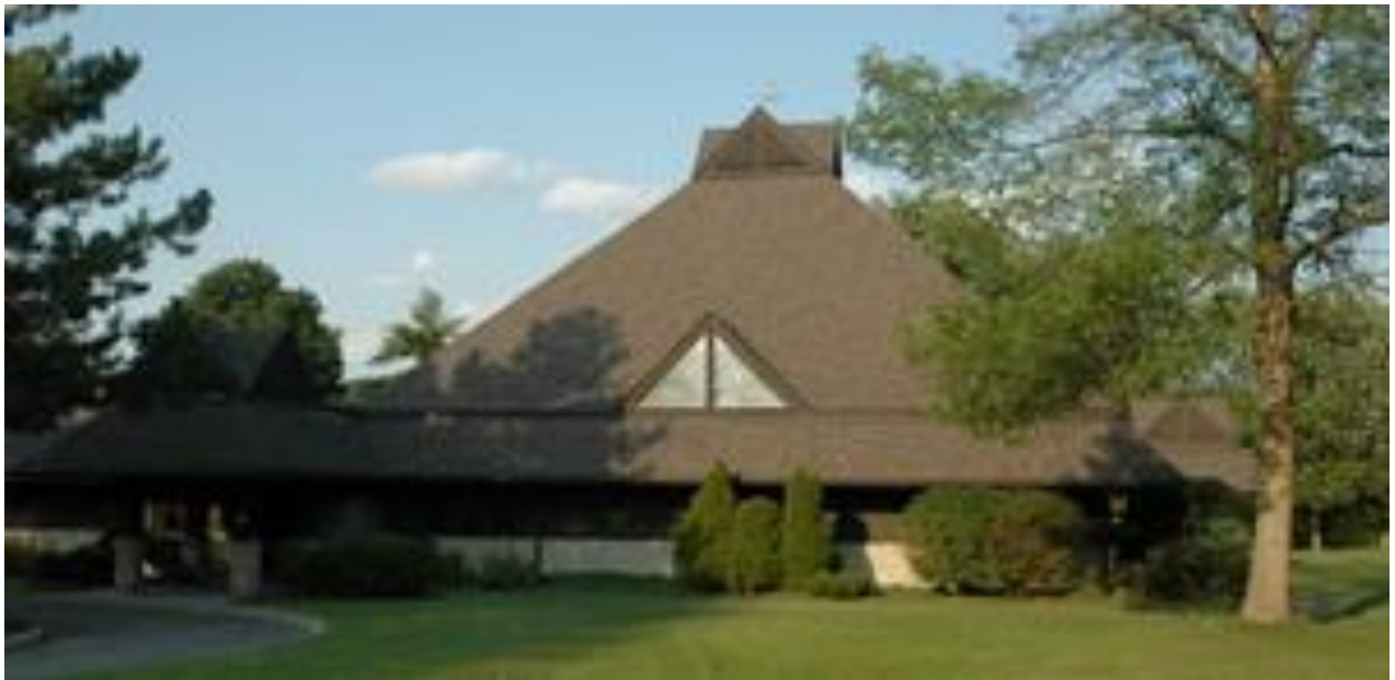
Kanata United (beside Stephen Leacock School) – on the pathways