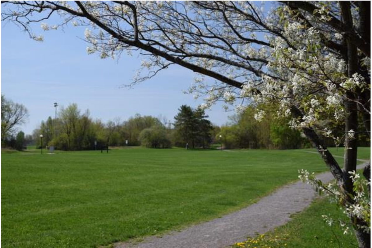
Sandwell Green (park) looking on Alison Wilson Woods