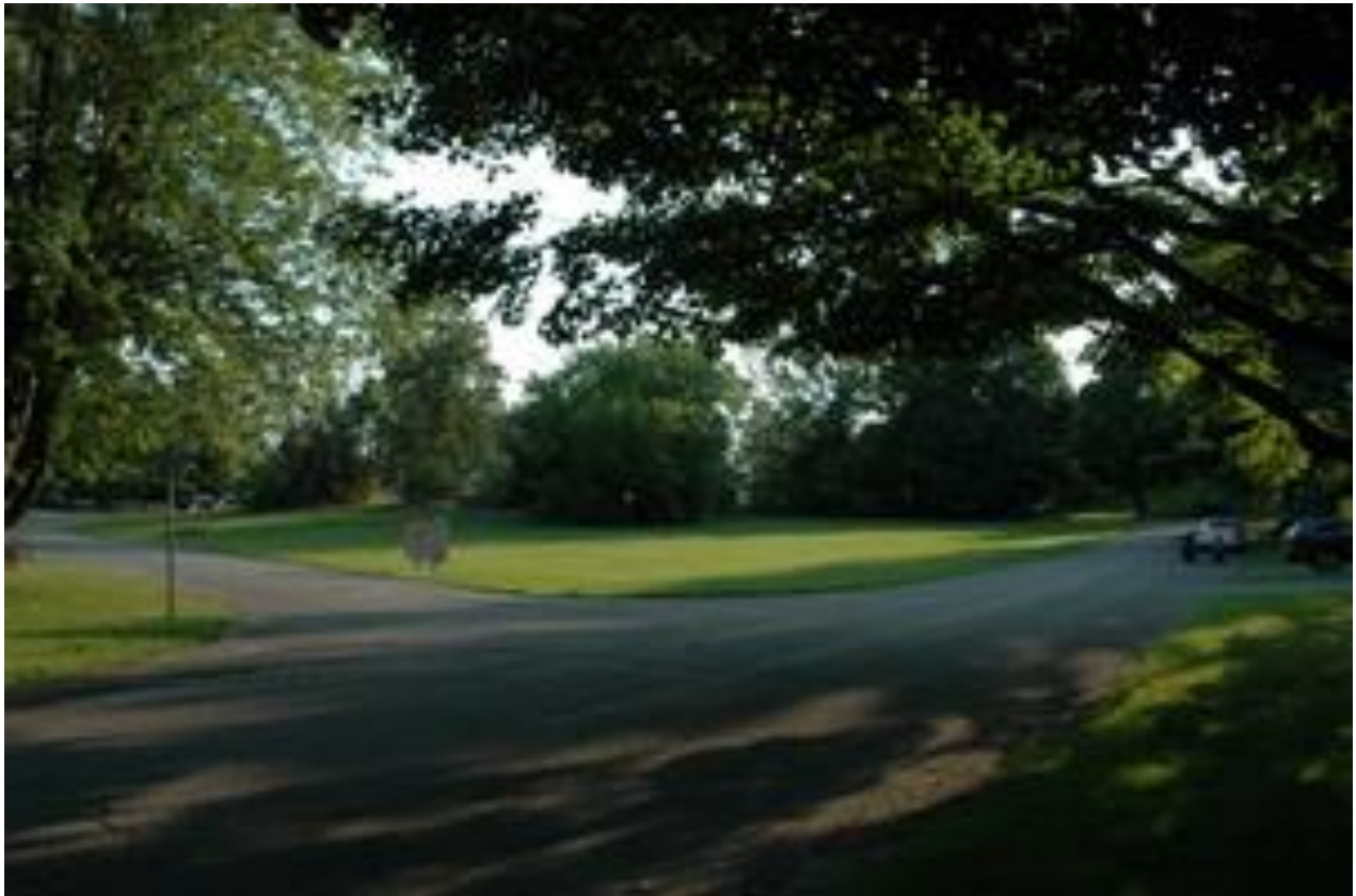
Centre Island – Borduas Ct – purchased by residents