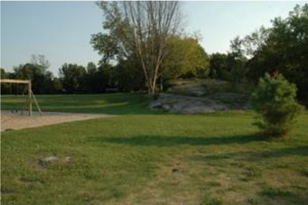
Park behind Elementary Schools/homes on Varley